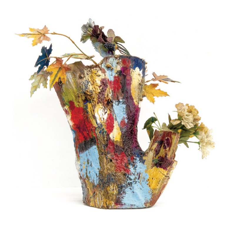
Untitled, 1980s, mixed media 22 x 20 x 11 in. / 59 x 56 x 28 cm, The Arnett Collection

In time, Williams began making large, paintedwood cutout figures of comic-book superheroes, which he displayed in the yard of his home. He produced mixed- media assemblages, including a one-person vehicle, and numerous, sculptural pencil holders, some of which resemble familiar objects. (One of them cleverly takes the shape of a missile poised for launch.)