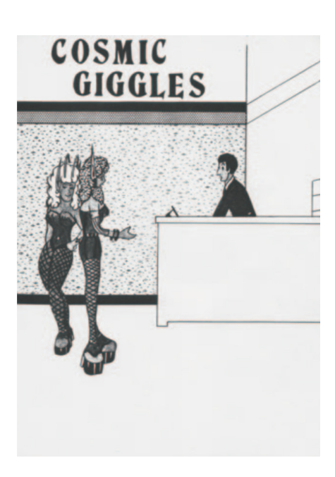
left to right: Captain Soul, early 1970s, graphite on paper with collage; Untitled (Black Power, from Cosmic Giggles), c. 1975, graphite and ink on paper; Untitled (cover illustration, Cosmic Giggles), circa 1975, graphite and ink on paper; each sheet, 11 x 8.5 in. / 28 x 22 cm; all works in the Collection of the Kentucky Folk Art Center, Morehead State University