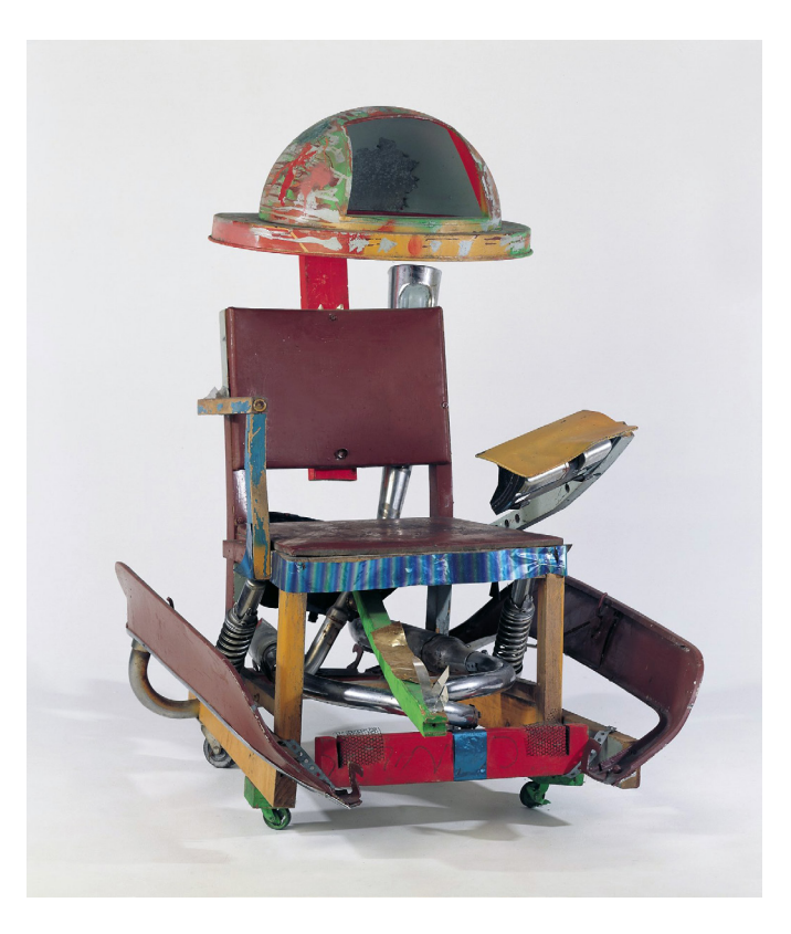
Fantasy Automobile, early 1980s, mixed media, 51.5 \times 38 \times 43 in. / 130 \times 97 \times 109 cm, Souls Grown Deep Foundation