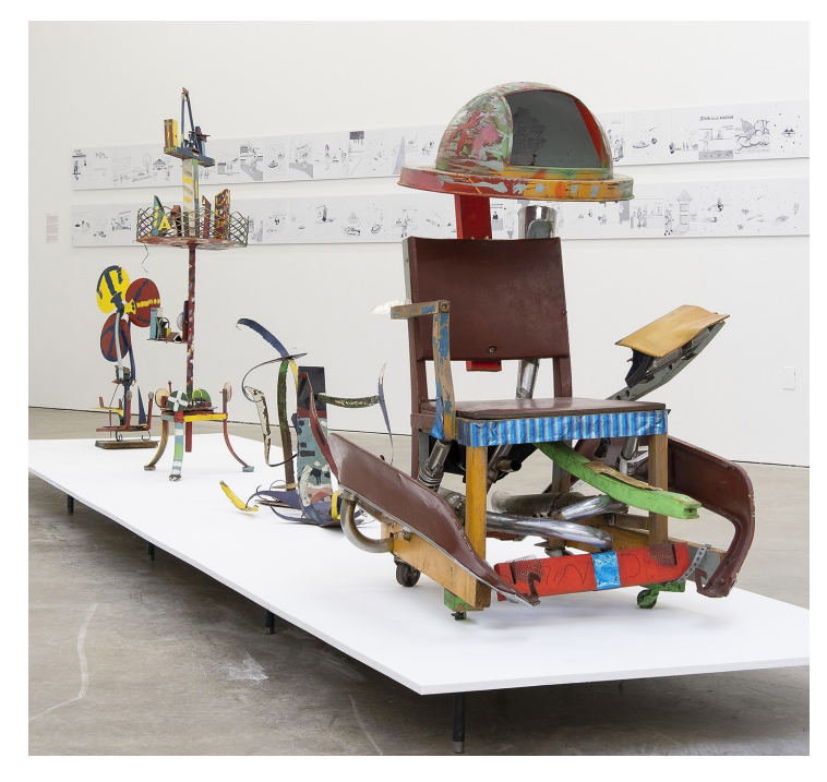
Charles Williams, "Fantasy Automobile" (circa 1980s), mixed media, dimensions variable

The exhibition features more than 100 objects, including mixed-media sculptures, paintings, and text-and-image comics. To assemble the exhibition, Jones combed through the holdings of Arnett's own personal collection and those of the Kentucky Folk Art Center at Morehead State University in Morehead, among other sources.