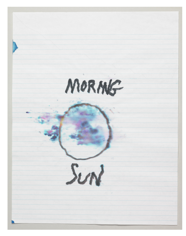
Eric Rhein, Untitled (from Hospital Drawings), 1994.