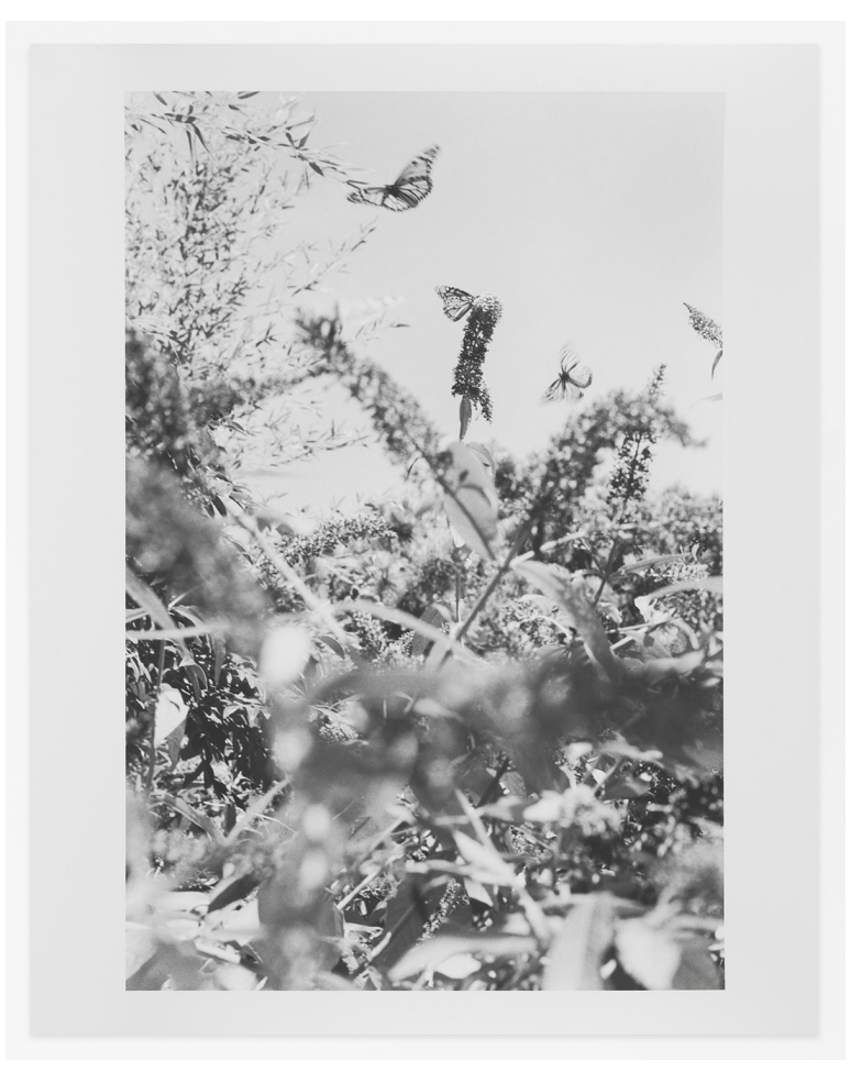
Eric Rhein, Visitation (Fire Island), 2012.