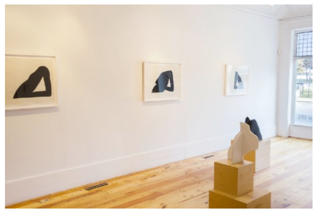
Installation view: Amy Pleasant: 'Someone Before You', Institute 193