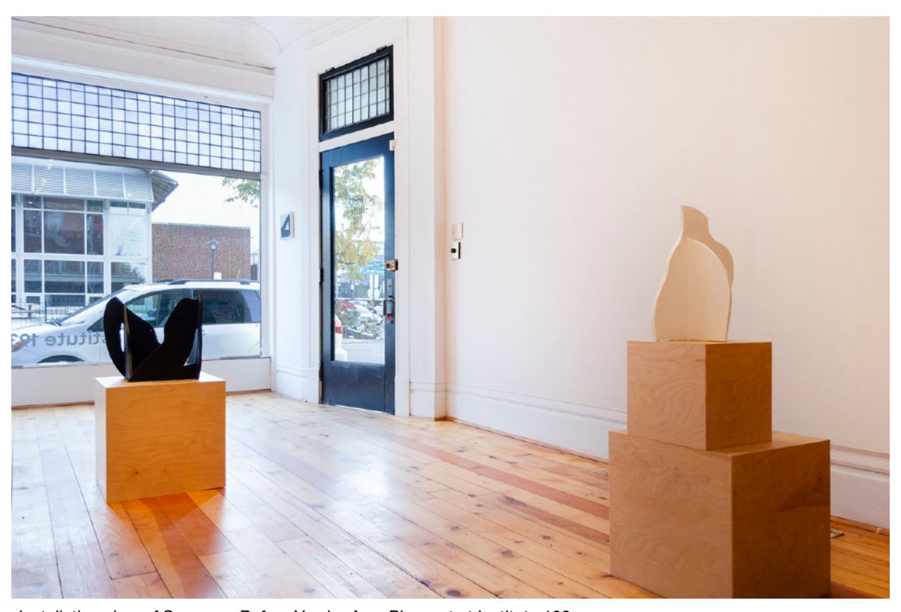
Installation view of Someone Before You by Amy Pleasant at Institute 193

Institute 193 is an intimate place; it is a small, one-room storefront gallery space that pulls viewers in from Lexington's Limestone Street for a different kind of consumption than they might find in the neighboring bars, restaurants, and coffee shops. The intimacy makes this venue the perfect site to view painter Amy Pleasant's work, now on view in the exhibition "Someone Before You." The show is simply arranged, comprised of a handful of drawings and ceramic sculptures alongside a single painting. Yet the works allude to the highly prolific nature of Pleasant's practice, which is further affirmed in the companion artist's book, The Messenger's Mouth was Heavy. The proximity to the work in both the space and in the book offer an opportunity for the viewer to deeply consider how and what each work communicates.