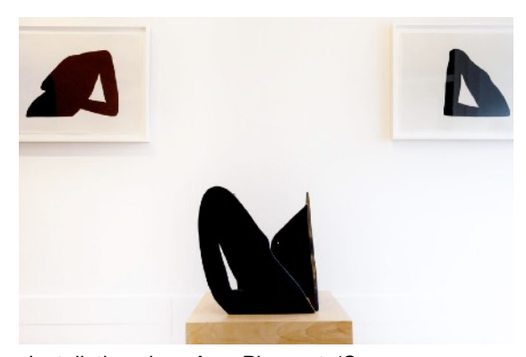
Installation view: Amy Pleasant: 'Someone Before You', Institute 193

The abstraction of these forms – specifically the absence of shading, contours, and modeling so often used to render in two dimensions the curvature of our three-dimensional figures – connects them to a broader history of abstract painting in general. Pleasant uses the allusion of the body to explore the implications of color and the painterly gesture, aligning her work with a broader corpus of abstract painters, drawing on the legacy of artists like Willem and Elaine de Kooning. At the same time, the gestures of Pleasant's figures, particularly the reclined