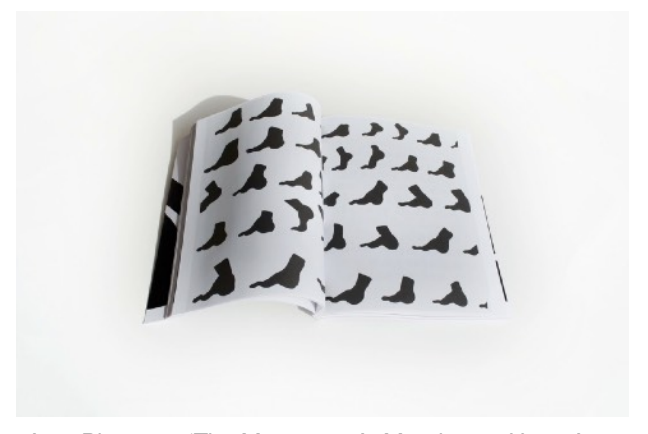
Amy Pleasant, 'The Messenger's Mouth was Heavy', 2018

atop custom wood plinths, these works remind us that the materiality of the human body is not so distinct from the environment around us. Moreover, the malleability of clay and its eventual coalescence into a single shape parallels the journey of the human body as it transforms over time into an eventual final body, one that will eventually return to dust. This rumination on the body is made possible because of Pleasant's fragmentation thereof. In focusing in and abstracting specific elements of the human form, we are able to consider in greater depth what a body is and how it