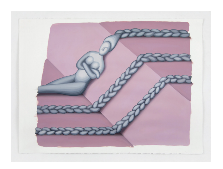
R & R & R, 2019 Acrylic on paper 22.5 x 30 inches