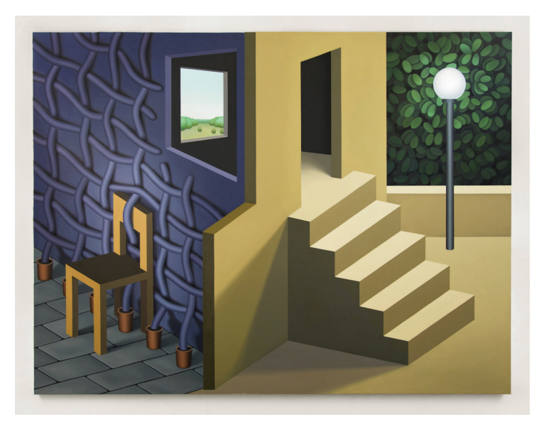
Up Out In, 2019 Oil on canvas 72 x 96 inches

Another aspect of the works on view that echos control and tension in an intriguing way is Ludwig Shaffer's treatment of the female