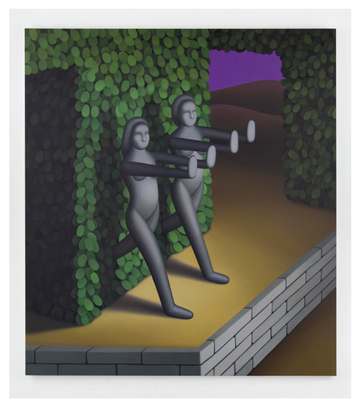
From The Ha-Ha Wall Comes The No-No Dance, 2019 Oil on canvas 72 x 65 inches

Ha-ha is a wall structure that acts as a physical separator without breaking the visual flow of the landscape. Aside from grounding the references to gardens and greenery, which abound in Ludwig Shaffer's work, this term allows us to speak about "control" as one of the themes explored on the painted surface. Much like the Ha-Ha wall's ability to assert a boundary while preserving a certain viewing and traversing of the landscape, many of