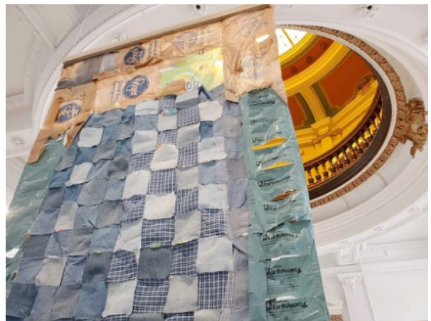
his life, constructing complex environments sewn from sacks, fabric, and other found materials.

The work in this exhibition is a sampling of an immense body of quilts made mostly from layers of reclaimed plastic bags. They hang from the ceiling, mounted with wooden bars, and can be viewed from all sides. Walking among these works is something like a religious experience. It takes time for the variety of pattern and texture to sink in. With sunlight slanting through the windows, differing thicknesses and transparencies are evident.